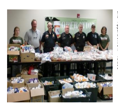
Drug Take-Back Event

To dispose of prescription and over-the-counter drugs, call your city or county government's household trash and recycling service and ask if a drug take-back program is available in your community. Some counties hold household hazardous waste collection days, where prescription and over-the-counter drugs are accepted at a central location for proper disposal.